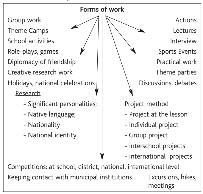
Figure 3 - Forms of work in citizenship education and identity in schools

To be a productive citizen means to do practical things - role-play, discussion, creative research, field work and many others such as those presented in the following diagram. We also approach in a deeper way a strategy based on community relationship - service learning - because it is a very productive, active and critical thinking way to develop participative citizenship and identities in schools.