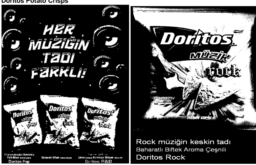
A detail of crisps package (Based on ad. of Doritos in music magazine Billboard, March 2008, p 7)

With the same organization principle, images of pepper, hot pepper and steak are chosen. The youth illustrated as dark shadows refers to 'night and the party' pair as we have noticed in other advertisements we have studied before. In this advertisement there is a call for being different and making choice required by pleasure. Thus crisp function as a symbol of identity.