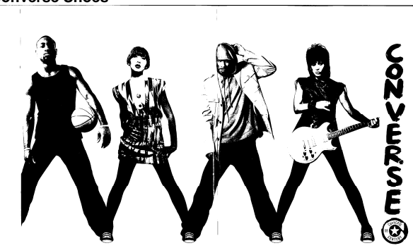
(Based on ad. of Converse in music magazine Billboard, March 2008, p 1)