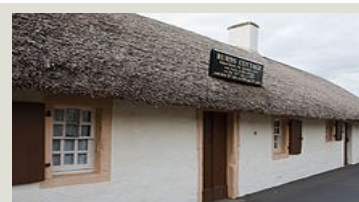
Burns Cottage, Ayrshire