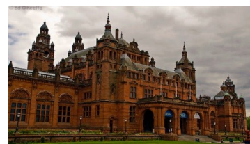
Kelvingrove Art Gallery and Museum, Glasgow