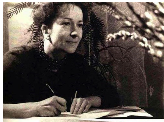
Wisława Szymborska (1923-2012). Polish writer and poet, Nobel prize awarded 1996.

Meanwhile, people pe- rished, animals died, houses burned, and the fields ran wild just as in times immemori- al and less political.